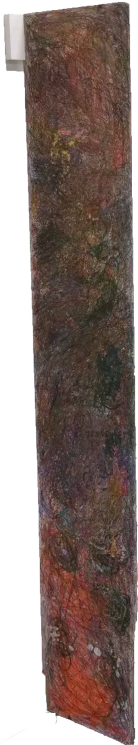
Untitled (Cars 3) Mixed media on wood $55