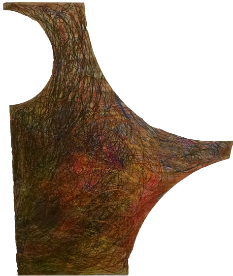
Untitled (Cars 2) Mixed media on wood $65