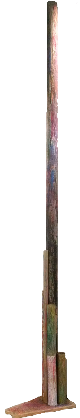
Untitled Tube 2 Mixed media on cardboard with wood base $85