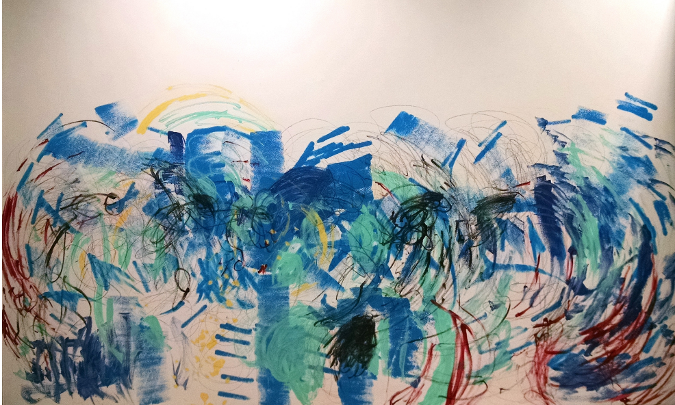
Makindamess acrylic wall painting NFS