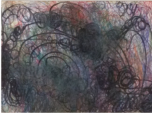
Herbies Mixed media on paper $75