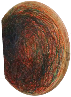
Untitled (Cars 1) Mixed media on wood $45