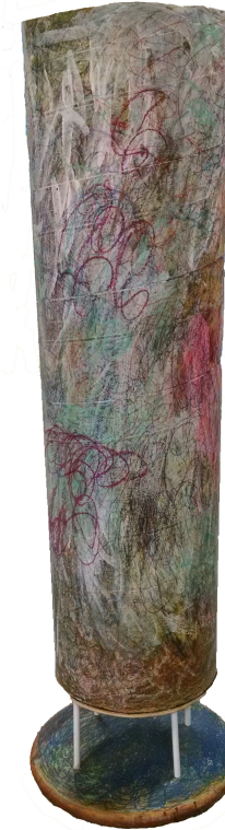
Untitled Tube 1 Mixed media on cardboard and wood $100