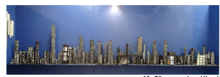
13. Cityscape, by . Mixed media sculpture. Price on request.

12. Pokemon Dragon, by Salem Bowman. Plaster bandage sculpture, $125