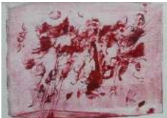
3. Untitled (three prints) , by Agatha Biddle. Relief print, $35