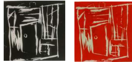
4. Black House , by Joyce Moseley. Relief print, $20