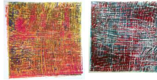
14. Untitled (two prints) , by Tim Quinn. Relief print, $75