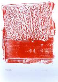
14. Kee , by Karlee Salamone. Monoprint, $25