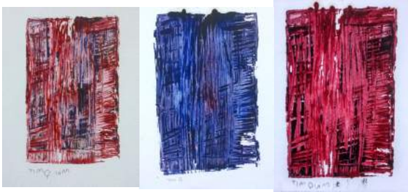
10. Untitled (three prints) , by Tim Quinn. Relief print, $50