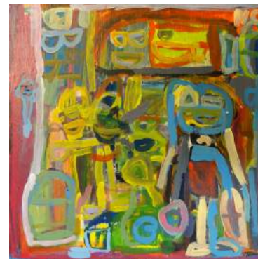
9. Bodies and Shadows , by Brandon Spicer-Crawley. Acrylic on board, $65