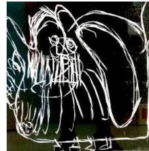
7. The Cow , by Clyde Henry. Relief print, $38