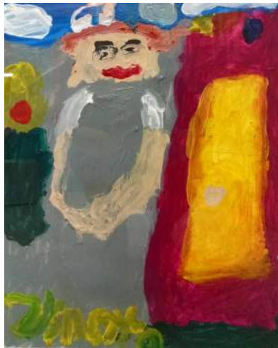
12. Portrait of a Girl , by Vinetta Miller. Acrylic on paper, $55