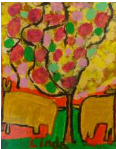
2. Two Deers Under the Tree , by Linda Costa. Acrylic on panel, $50