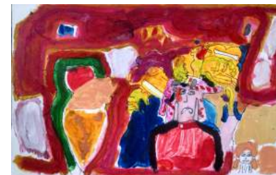
18. A Man and a Woman Creation , by Tara Johnson. Mixed media on paper, $40