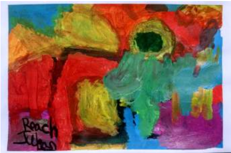
1. Sun Clouds , by Julian Roach. Acrylic on paper, $50