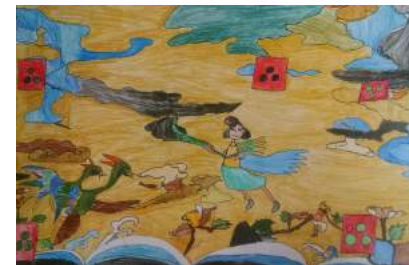
17. The Raven Book , by Olu Ojo. Pencil on paper, $40